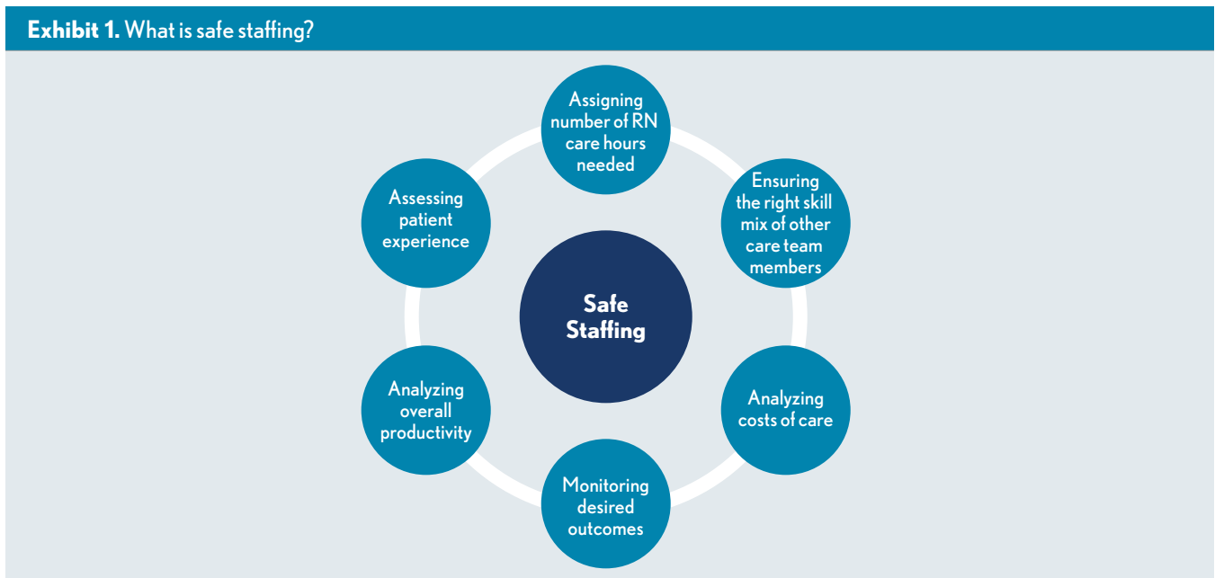
Exhibit 1. What is safe staffing?

It is important to note that nurses at every level, including staff nurses, routinely make decisions that can impact the organization's financial health. For example, being aware of the issue of patient supply waste and making an effort to reduce it advances key organizational and systemic waste reduction goals. 5 Staff nurses are also keenly aware of the need to anticipate and plan for patient and family transitions in care that affect hospital length of stay, post-hospital resources and patient education to increase adherence to discharge instructions and follow-up care, all of which can have significant impact on finances. Also, nursing care is a key contributor to the patient experience. As such, the quality of the nurse work environment is strongly associated with patient satisfaction as measured by the Hospital Consumer Assessment of Hospital Providers and Systems Survey (HCAHPS), in particular